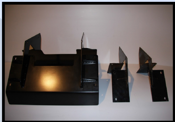
The Simon Innovations Difference

Our Fertilizer Brackets are engineered to handle the strain from adding 400+ pounds of extra weight from using hopper extensions.